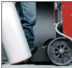
Built-in Undercarriage With Easy-Load Gas Cylinder Platform