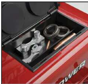
Gun Expendable Parts Compartment