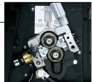
Professional Heavy Duty MAXTRAC® Wire Drive System