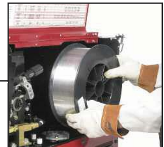
Easy-Load Wire Compartment