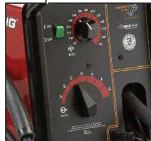
Improved Control Panel, More Convenient Gun Connection and Power Switch Locations