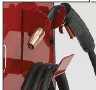
Coil Claw Keeps Your Workstation organized